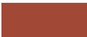
Tile Red 637