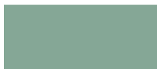
Emerald Green 740