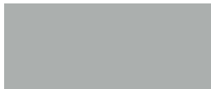
Goosewing Grey 222